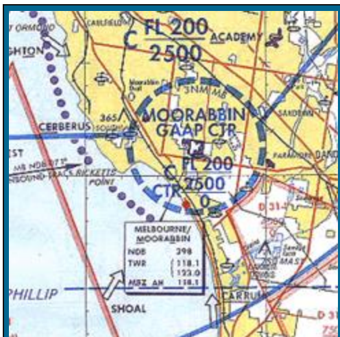
Moorabbin as seen in the VTC

Below is a portion of the Moorabbin area applicable on the Visual Terminal Chart.