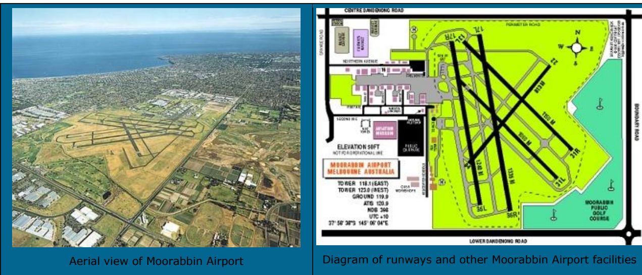
Aerial view of Moorabbin Airport

Moorabbin Airport also has several Citation jets which visit on a weekly basis. The largest visitors we see at Moorabbin on an infrequent basis are DC3s. We have had C130 RAAF Hercules land but most of the taxiways can't support their weights.